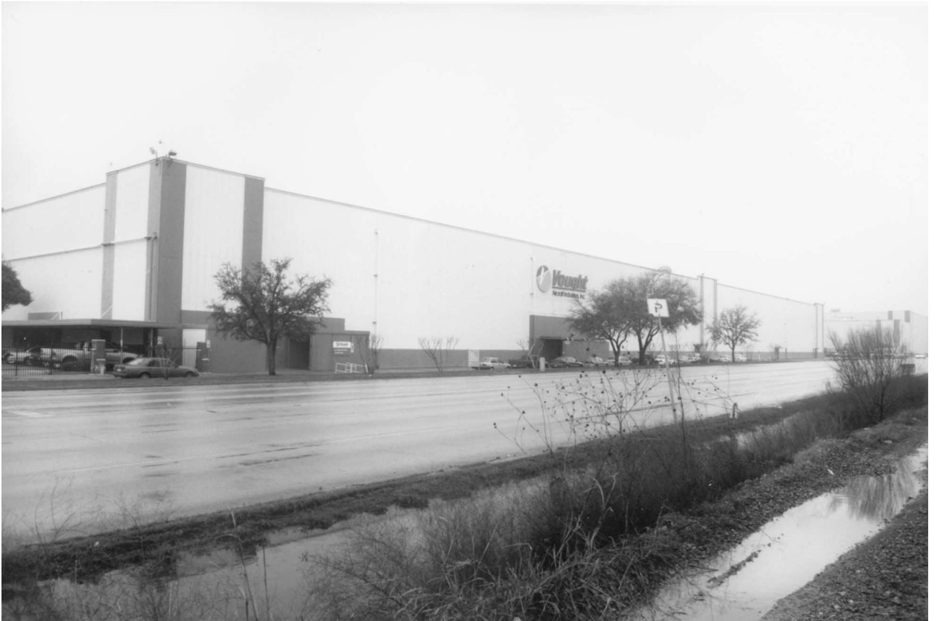
NE corner of Facility 7, camera facing SW