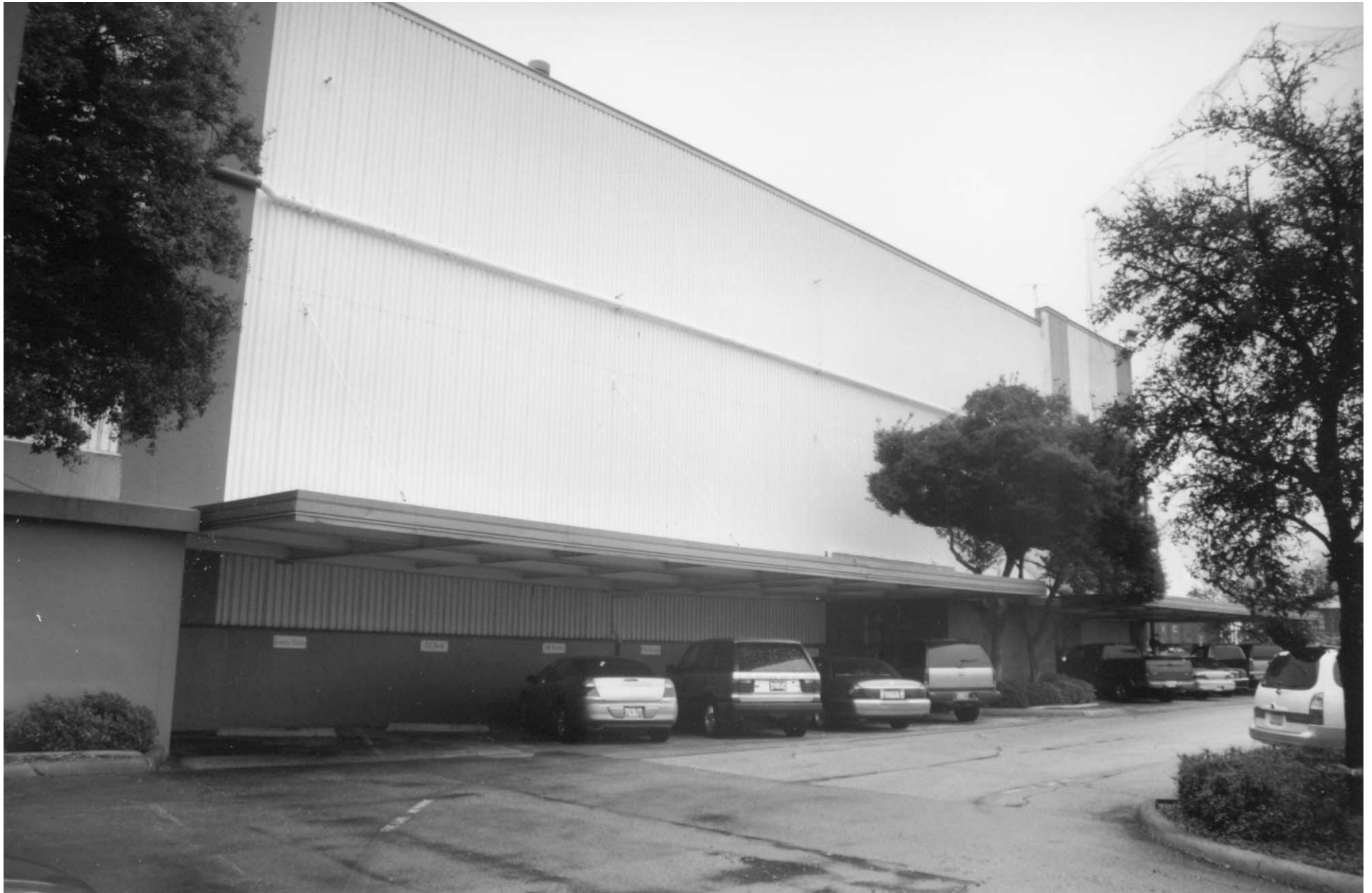
Oblique view of E facade of Facility 7, camera facing NW